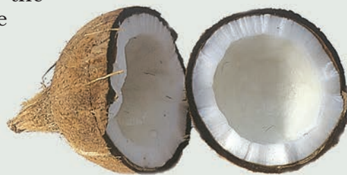
Fig. 5.1b A coconut The coconut and the paan were things that struck many travellers as unusual.