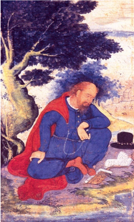
Fig. 5.6 A seventeenth-century painting depicting Bernier in European clothes