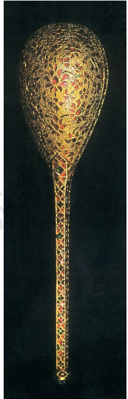
Fig. 5.12 A gold spoon studded with emeralds and rubies, an example of the dexterity of Mughal artisans

➤ In what ways is the description in this excerpt different from that in Source 11?