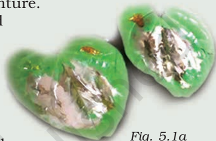
Fig. 5.1a Paan leaves

In this chapter we shall see how our knowledge of the past can be enriched through a consideration of descriptions of social life provided by travellers who visited the subcontinent, focusing on the accounts of three men: Al-Biruni who came from Uzbekistan (eleventh century), Ibn Battuta who came from Morocco, in northwestern Africa (fourteenth century) and the Frenchman François Bernier (seventeenth century).