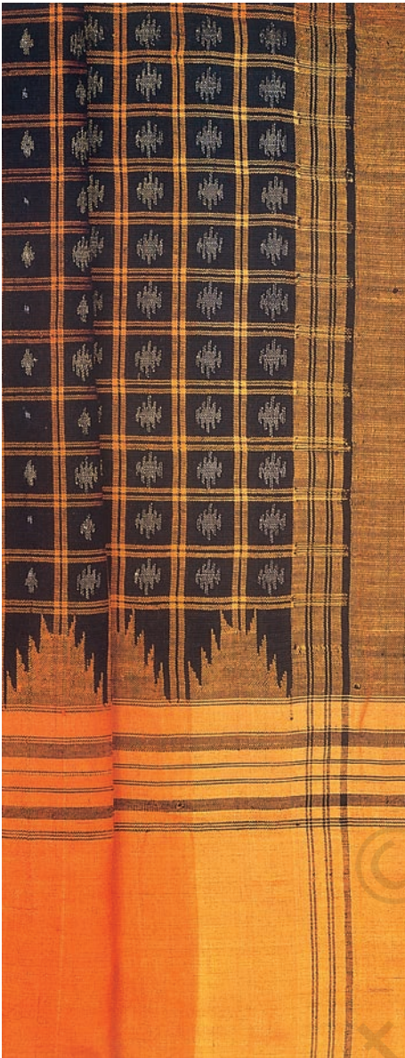
Fig. 5.10 Ikat weaving patterns such as this were adopted and modified at several coastal production centres in the subcontinent and in Southeast Asia.

➡ Why do you think Ibn Battuta highlighted these activities in his description?