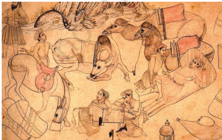
Fig. 5.14 A painting depicting travellers at rest