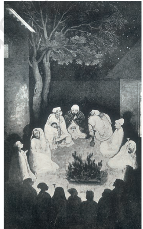
Fig. 5.5 An eighteenth-century painting depicting travellers gathered around a campfire

Compare the objectives of Al-Biruni and Ibn Battuta in writing their accounts.