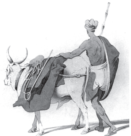
Fig. 5.11 Drawings such as this nineteenth-century example often reinforced the notion of an unchanging rural society.

As an extension of this, Bernier described Indian society as consisting of undifferentiated masses of impoverished people, subjugated by a small minority of a very rich and powerful ruling class. Between the poorest of the poor and the richest of the rich, there was no social group or class worth the name. Bernier confidently asserted: "There is no middle state in India."